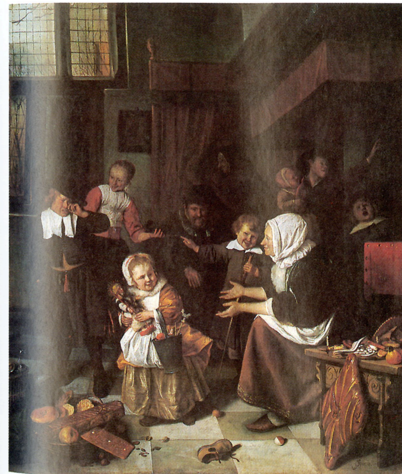
◀ Figure 3–2 Notice the title of the work. What American holiday is similar to the one being celebrated in this picture? What do you think the man at the right is pointing to?

Notice that while every work of art uses elements, not all have subjects. Figure 3–1 is a painting without a recognized subject. Because such works are not “about” something, some viewers are uncertain how to describe them. These viewers should learn to focus attention on the elements of art. This is what the critic—or anyone else—will see in this work. This is called describing the formal aspects of the work.