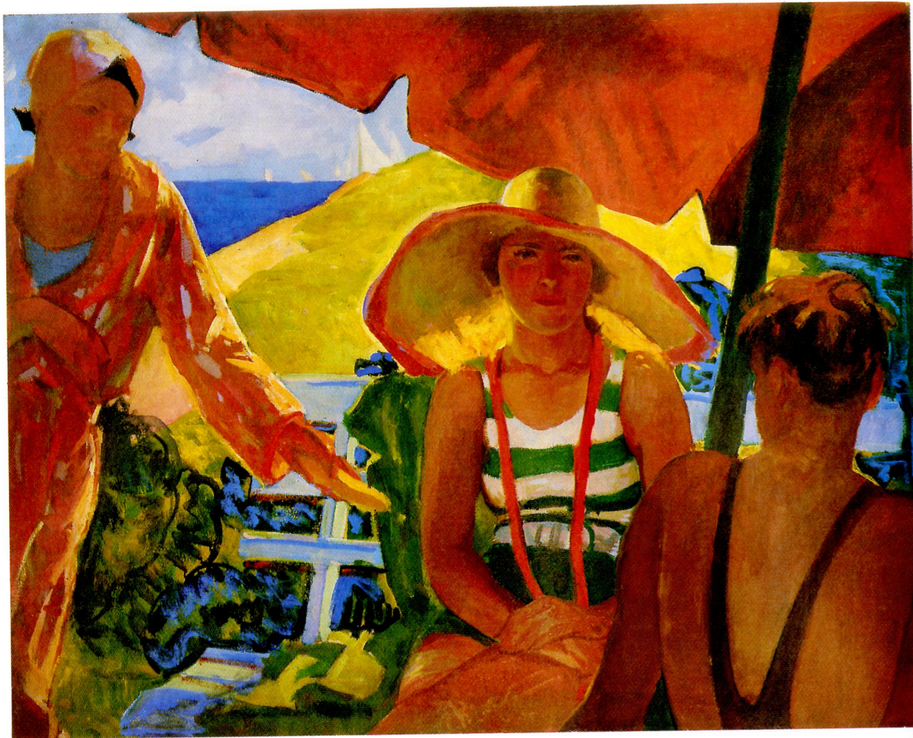
▲ Figure 3-3 Is this work successful because it looks lifelike or because it expresses an idea or mood? Why is it necessary to use more than one aesthetic view when judging works of art?

Beatrice Whitney van Ness. Summer Sunlight . c. 1936. Oil on canvas. 99.1 x 124.5 cm (39 x 49"). National Museum of Women in the Arts, Washington, D.C. Gift of Wallace and Wilhelmina Holladay.