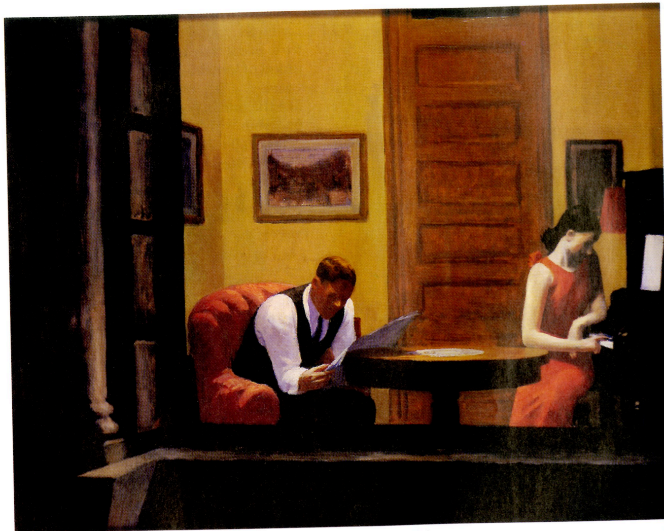
▲ Figure 3-6 What makes this work more than just a realistic picture of two people in a room? How do these people behave toward each other? How do their actions make you feel?

Answering these and similar questions is the goal of art history. In this lesson you will learn ways of answering these questions.