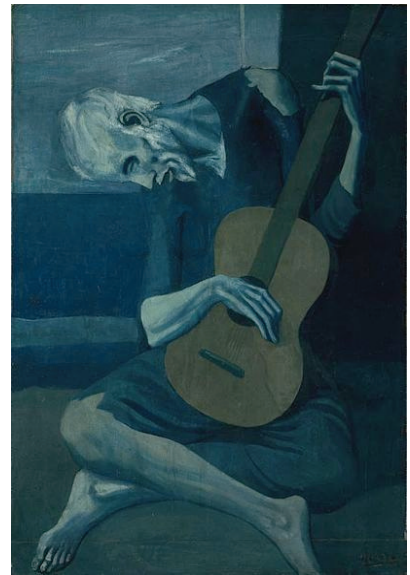
Picasso’s Blue Period

Throughout all of Picasso’s career, through all his different styles, he was also an illustrator. He would produce drawings, sometimes for books, that used fast-drawn lines that were then brushed with ink. These illustrations were very simple, and often only used very few lines, but a person could always tell just what Picasso wanted to show. In all of his many styles, he was always trying to find a way to show the world how he saw things in his imagination.